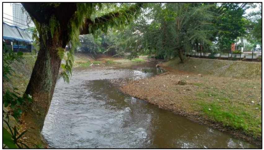
Figure 1. Cikapundung River, seen from Jalan Asia Afrika

The decline in water quality due to pollution in the Cikapundung River will affect many interests, including the availability of raw water. The Cikapundung River is one of 13 tributaries that empties into the Citarum River, flowing across three urban regencies, namely Bandung City, Bandung Regency and West Bandung Regency which cover 11 sub-districts. This 28-kilometer-long river empties into the Citarum River in Bale Endah (Bandung Regency) and is one of the 13 main tributaries that supply water to the Citarum River (Bappenas, 2022a).