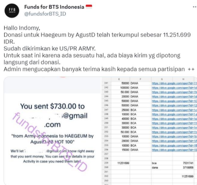
Figure 3. Account posting @fundsforsBTS_ID in carrying out social actions

the relationship between one actor and the actor on the Twitter account @fundsforbts_id has the most significant relationship. This is shown by the many interactions where the account often receives donations for BTS members and also has activity of 374 retweets, 20.9 thousand views and 832 likes which is quite a lot.