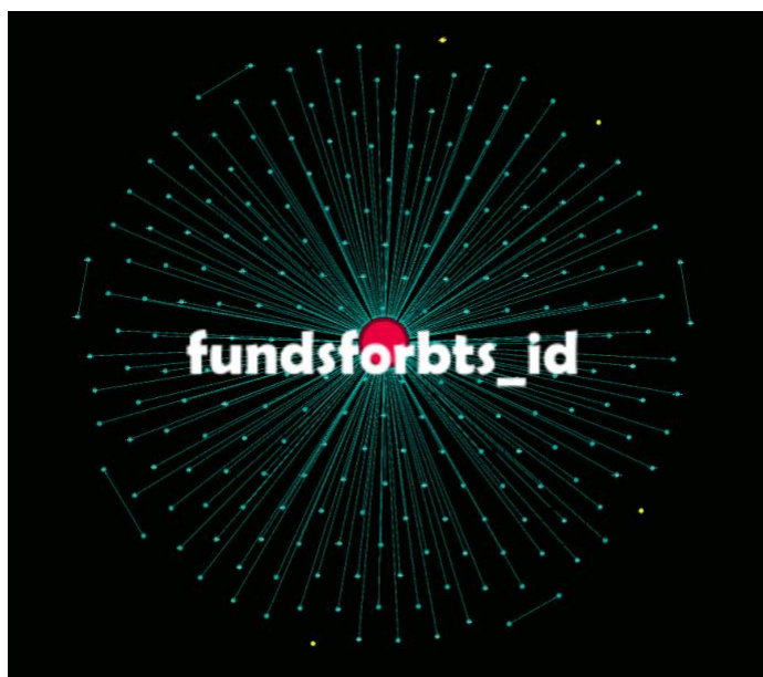
Figure 2. Graph of Actor Network in BTS-ARMY Fans Social Action Source: Processed by researchers in 2023

Based on the results of crawling data which is then visualized in terms of nodes and edges. The social actions of K-Pop fans carried out by ARMY BTS fans through the keywords "ARMY" and "Donate" were analyzed through eigenvector centrality via Gephi. This measurement shows the actors who are most influential and play an important role in the BTS social action network. In figure 2. the actor who plays an important role is @fundsforbts_id. This account is a BTS fanbase account that aims to manage social action resources and information in the form of receiving donations and making donations. This twitter account has a strong influence in coordinating donation actions carried out by ARMY. This account is also the only account that has an interaction center in disseminating information related to donations.