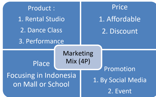
Table 1 4P analysis of IDOLAB

A dance studio 4P analysis is frequently developed as well in order to determine the Product, Promotion, Price, Place that are normally faced by these businesses. 4P analysis in this study: