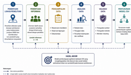
Figure 1. Research Methodology Flow

The entire research process is carried out by paying attention to the ethical aspects of research, namely maintaining the confidentiality of the identity of the informant, obtaining participation consent, and ensuring that the data is used only for scientific purposes.