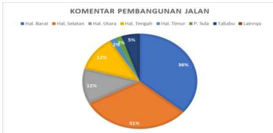
Figure 3. Percentage of Public Comments Regarding Road Damage per Regency/City in North Maluku