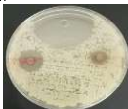
Figure 2. Antibacterial Disc Diffusion

by finding DIZ, MIC, and MBC. The results are presented in Tables 2 and 3. In Figure 2, an inhibition zone can be observed around the three treatment groups, indicating antibacterial activity against Salmonella typhimurium .