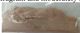
Figure 5. results of instant drinks

The image below shows the freeze -dried powder creating a white and pale cream in color. The resulting powder has a fragrant and moderately sweet aroma.