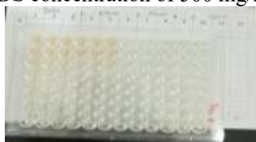
Figure 3. Microdilution for MIC Determination

Although the 3 groups provide a direct effect for antibacterial, to get clear and optimal results as in the picture above, it takes <5 hours for antibiotics and >5 hours for conventional bay leaf extract and bay leaf SNEDDS concentration of 500 mg/mL in an incubator.