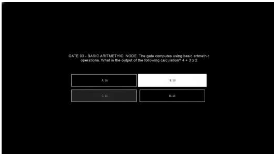
Figure 2: Sample Question Dialog Flow Design