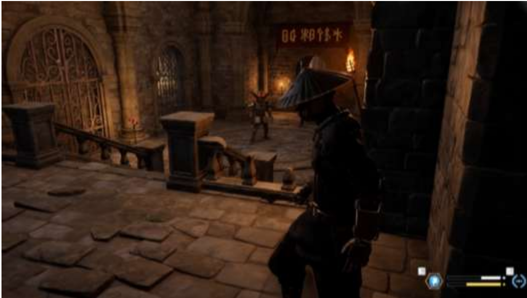
Figure 3 Novus Game Environment: Sole Remnant