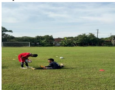
Figure 4 Helping Opponents When Injured

In the process, Darupono young coaches not only teach techniques, but also instill moral values and social character through real examples in the field. For example, they reprimand children who play rough or do not want to cooperate, as well as give appreciation to children who show sportsmanship and respect for friends.