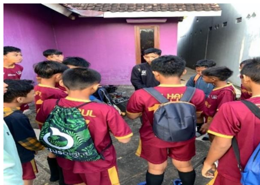
Figure 3 The Concept of Discipline

Darupono Village Field Area: Source (2025 Documentation)