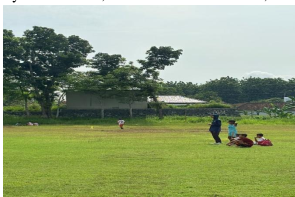
Figure 5 Damaged Field Conditions

One of the main challenges in developing football at an early age is the lack of facilities and infrastructure. There are several communities or schools in the area that still use makeshift fields with limited equipment. Limited operational funds also cause training activities to not always run consistently. All activities of Darupono Football School (SSB) still depend on self-help and voluntary parental donations. The absence of a fixed allocation of funds from certain villages or institutions makes the sustainability of activities highly dependent on the enthusiasm and commitment of the trainers. The results of these observations are strengthened by an interview conducted by the author with Rio Teguh as the goalkeeper coach at SSB Darupono, on October 26, 2025: "The field here is still ordinary land, so if it is rainy, it is often muddy. Sometimes the ball is only two or three, so we have to take turns,"