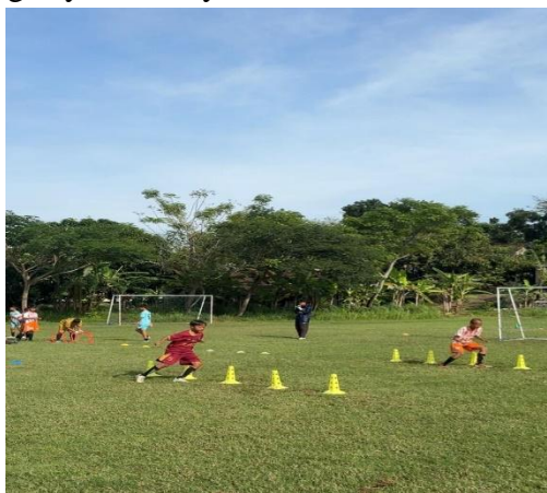
Figure 2 Zig-zag dribble concept

At SSB Darupono, the development of motor skills is carried out simply but effectively by trainers from village youth. The young coaches understand the children's character and create a fun and non-stressful training atmosphere. They use game methods such as zig-zag dribble, to train children's agility and body coordination.