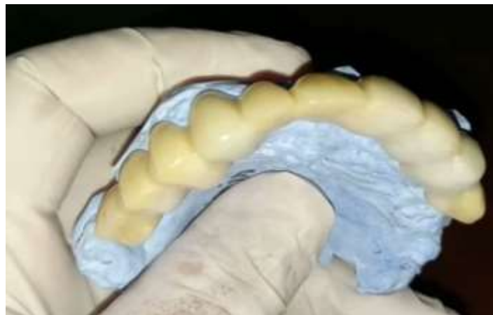
Picture 6. 3 months after surgery