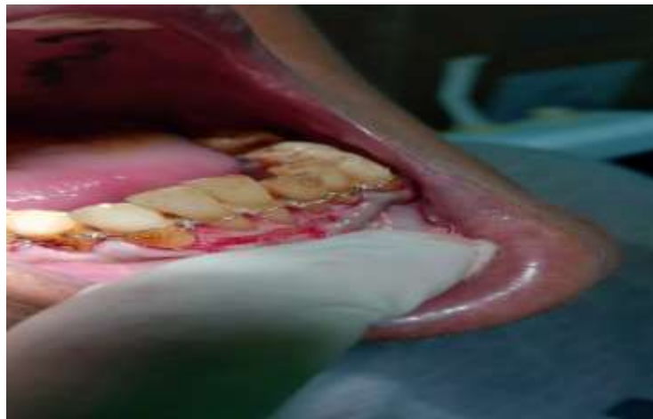
Picture 1. Flap gingiva lower jaw and wire splint

Diagnose ; Cases of chronic periodontitis stage IV grade C, is a condition of periodontal disease caused by gram negative bacteria for a long time, which results in alveolar bone destruction >5 mm and affecting >5 teeth. Usually, acquired due to trauma, there is a fractured bone defect, and 20 remaining teeth are in the mouth, the condition is exacerbated if the patient has systemic disease, poor oral hygiene, and is a heavy smoker.