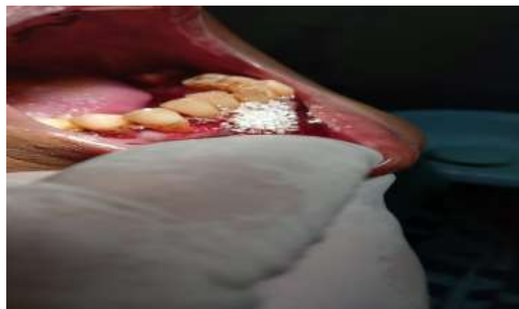
Picture 2. Bone graft