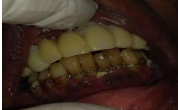
Picture 5. Acrylic fix bridge