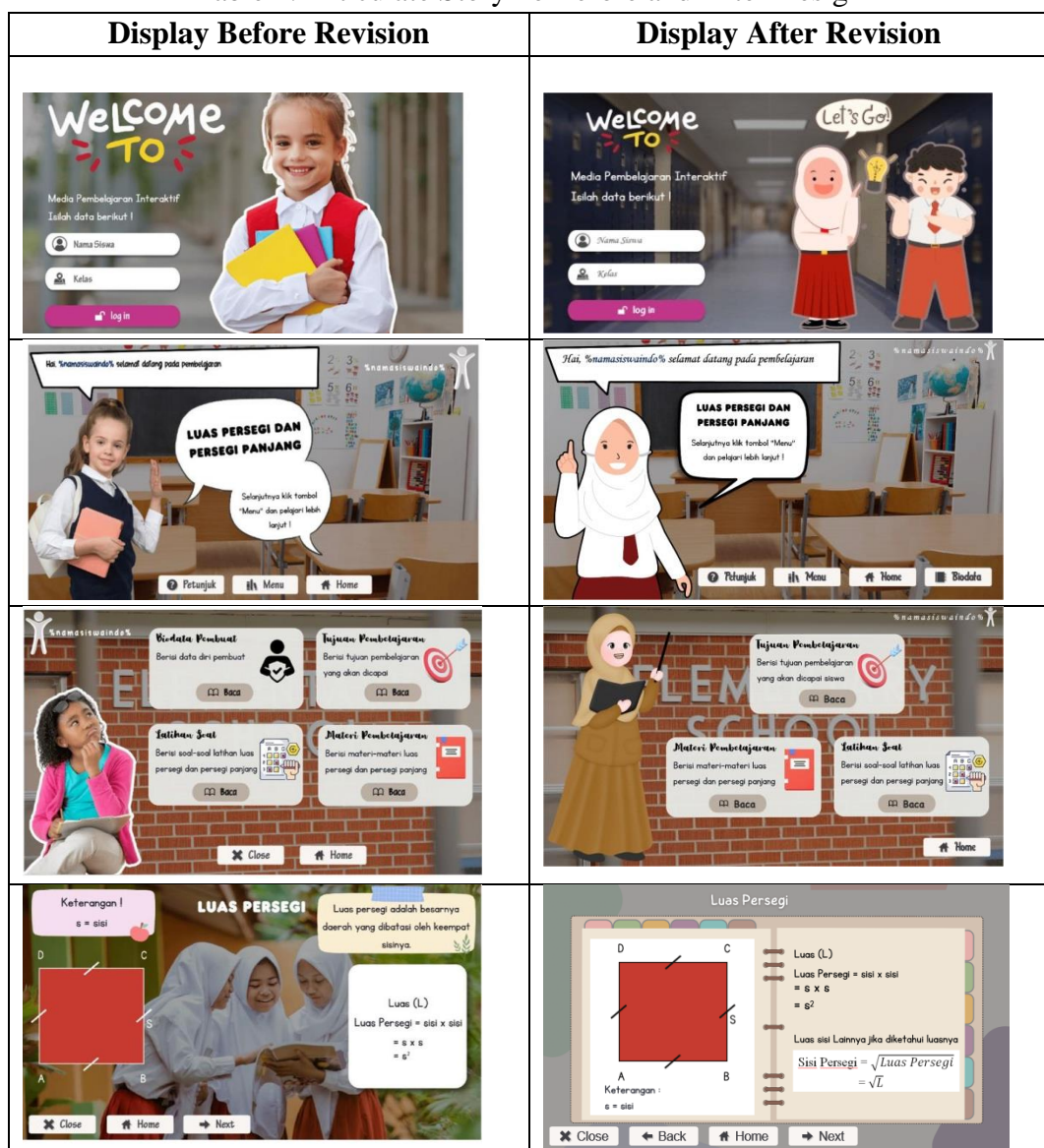
Table 2. Articulate Storyline Before and After Design

In this stage the learning media that has been made using articulate storyline will be shown to the supervisor, to assess its quality so that it can be immediately validated by the expert, after the supervisor approves, a validity test is carried out, namely, validation from a person who masters the theory, masters the media, and masters the language. After the expert trial is carried out, an assessment of the media is obtained, whether or not it is suitable for use in the field. At this stage there is a product revision process. Here are the results before and after product revision: