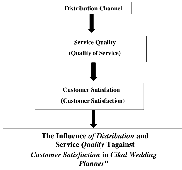
Figure 2. 1 Thinking