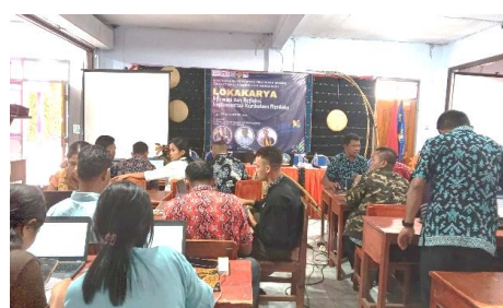
Photo 2. IKM Workshop with PjBL Model on the first day