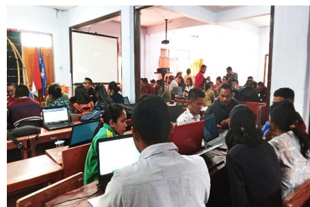
Photo 4. IKM Workshop with PjBL Model on the third day