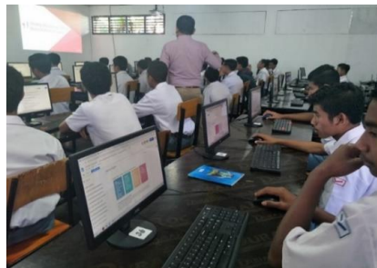
Photo 2. Practical Trial of PjBL-based Teaching Modules at SMKS Widya Bhakti Ruteng (Class XI Computer Network Engineering Department)