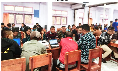
Photo 3. IKM Workshop with PjBL Model on the second day