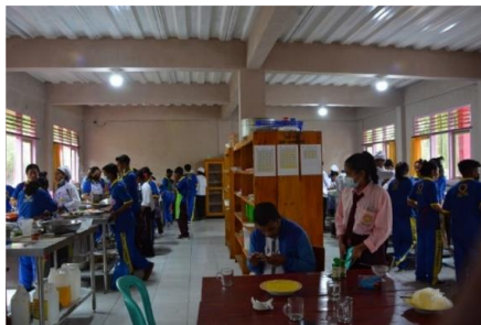
Photo 1. Practical Trial of the PjBL Teaching Module at Ruteng Tourism Awareness Vocational School (Class XI, Catering Services Department)