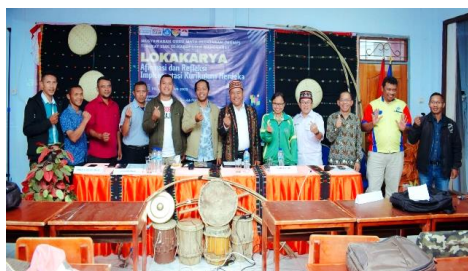
Photo 1. Opening Activity of the IKM Workshop with the PjBL Model

After the teaching tools in the form of teaching modules have been completed, each working group presents and receives feedback from other participants and facilitators as part of testing and adjustments. Thus, before implementing PjBL-based teaching tools in the classroom, teachers need to test them to ensure their suitability. Through discussion space and input from facilitators, they evaluate the draft teaching tools and make adjustments if necessary based on the feedback provided, both during workshop activities and when they are later implemented in schools. Next, the working group made a Follow-up Plan (RTL) in the form of a draft plan and scheduling for the implementation of PjBL-based teaching tools in their respective schools. Plans and scheduling must be made clear, focused and measurable in terms of time, supporting resources and preparation from teachers and students.