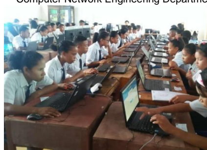
Photo 4. Practical Trial of the PjBL Teaching Module at SMKN 1 Satarmese (Class XI Computer Network Engineering Department)