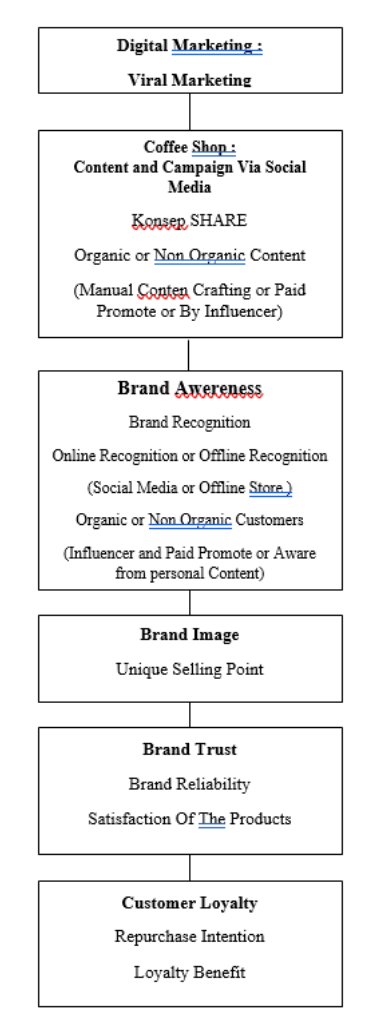
Figure 1. Conceptual Framework

interesting cafe interior designs or Instagramable terms giving a good impression on visitors, which has an important effect in building a brand that influences assessments (Mehdi, 2021). This research also has differences in the use of viral marketing itself, which leverages content developed by the Coffee Shop itself, especially in attracting customer interest to come and even spread to their acquaintances to create loyal customers.