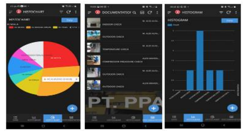
Figure 3. Access to AppSheet

This step aims to facilitate the Person in Charge (PIC) in identifying and recording maintenance reports efficiently. By providing clear identification numbers and QR codes on each AC unit, the PIC can easily access information related to the AC unit, such as maintenance history, technical specifications, and maintenance instructions. QR codes also enable the PIC to quickly scan the required information using their mobile devices. Thus, the creation of AC Number Lists and QR codes not only simplifies the maintenance reporting process but also helps improve the accuracy and speed of recording information related to the condition and maintenance of each AC unit. This step is crucial in ensuring transparency and efficiency in AC maintenance management at PT PPA Site SKS. The third step in optimizing the reporting and monitoring system for AC maintenance reports at PT PPA Site SKS is to provide access to AppSheet on each PIC's device for inspection and maintenance reporting of AC, as well as allowing monitoring of previous maintenance report history.