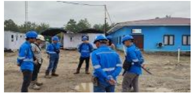
Figure 4. Socialization and coaching for Admin PIC

Appointment of the Electrical PIC Team specifically tasked with managing and monitoring all activities related to AC maintenance and care, the company can ensure more effective coordination in managing the AC system as a whole. The Electrical PIC Team is responsible for coordinating all activities related to inspections, routine maintenance, and necessary repairs on AC units, as well as ensuring that reporting is done accurately and promptly. Thus, the appointment of the Electrical PIC Team is a crucial step in improving the efficiency and effectiveness of AC maintenance management at PT PPA Site SKS. This step also helps ensure clear responsibilities and organized workload distribution within the team to achieve optimal maintenance reporting and monitoring goals. The fifth step in optimizing the reporting and monitoring system for AC maintenance reports at PT PPA Site SKS is to conduct socialization and coaching for the designated Admin PIC regarding the mechanism for reporting AC maintenance and care via AppSheet.